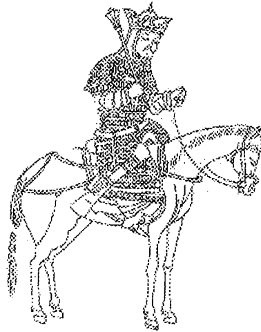
Figure 2 Mongol armor, beginning of the fourteenth century, Iran 12

sold four-inch squares of sheet iron to Indians who, like the Mongols, lacked easy access to metal stocks, for seven or eight gallons of corn each (Laubin, 1980, 116). This suggests one reason why it was the wealthy Mongols who possessed armor. And it suggests that, as Rubruck implies, the armor most of them possessed was made of leather, not metal.